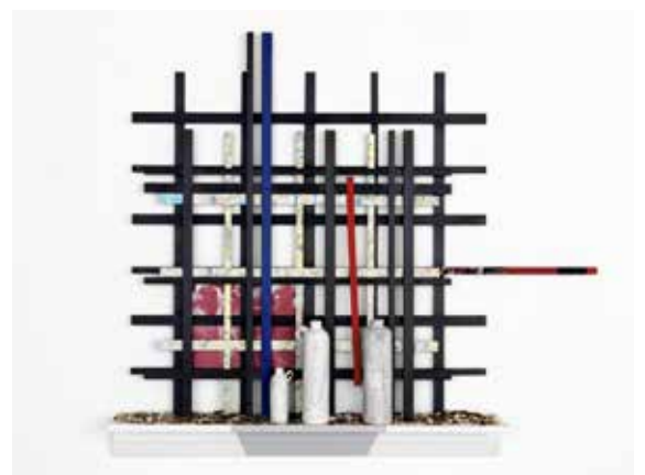
Remy Jungerman, Transition Obeach , 2013, mixed media, 51 1/8 x 61 x 5 7/8 in. (129.79 x 154.94 x 14.99 cm).

On May 8, Haim Steinbach and Remy Jungerman will consider the recontextualization of existing objects, and the cultural meanings of display.